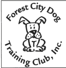
Licensed by the American Kennel Club

These Events are Accepting Entries for Mixed Breed Dogs Enrolled in the AKC Canine Partners Program