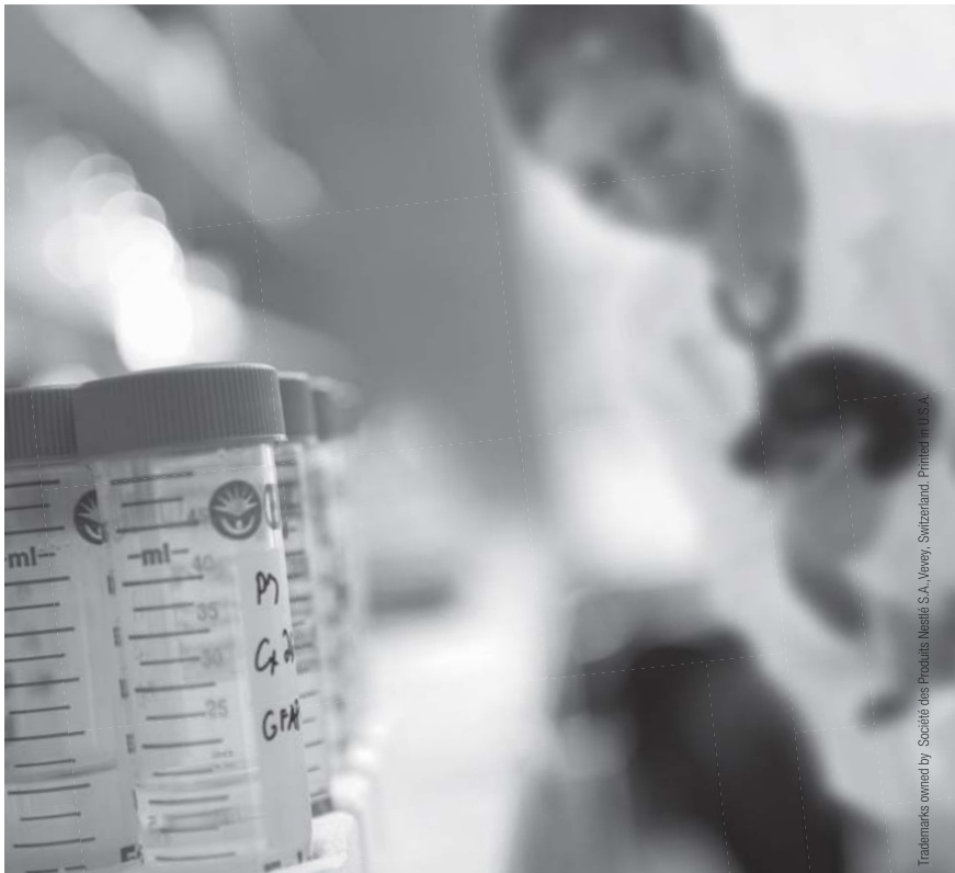
Trademarks owned by Société des Produits Nestlé S.A., Vevey, Switzerland. Printed in U.S.A.